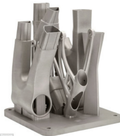
Bike frame components manufactured using additive manufacturing